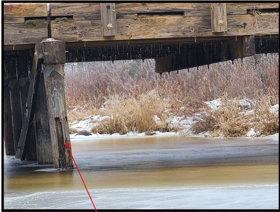
Decaying timber piles